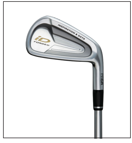
NEW iD FORGED IRON

Making full use of PRGR data, the NEW iD FORGED IRON also realizes a soft hitting sensation by inserting two layers of the silicon shock absorbent \alpha GEL inside the head, which reduces unpleasant vibration. Moreover, the iron uses the high-strength face material SAE8655M for a thinner face with higher initial velocity. The weight margin from the thinner face is effectively used in the center of gravity design to make the compact head easier to use. A different head thickness design is adopted for each iron, with the lower part of the head thickness for the long irons and the upper part of the head thickness progressing to the short irons. All the irons have the same center of gravity height (20.5mm) and center of gravity distance (37.5mm).