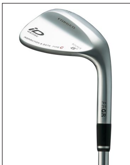
iD WEDGE TYPE C

*FP is an abbreviation for face progression. The FP value measures the distance between the centerline axis of the shaft and the leading edge of the face.